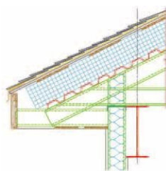
Schematic section of heat loss potential through cold-formed steel roof truss overhangs

Finding out why many buildings don't perform thermally as well as their energy model had predicted has been a topic of much debate lately. Modeling systems, building rating systems, and occupant operations have been identified as possible culprits. In addition, we must take a critical and humble look at the design and construction of the buildings themselves—especially to identify any significant flaws in our logic of building envelope design.